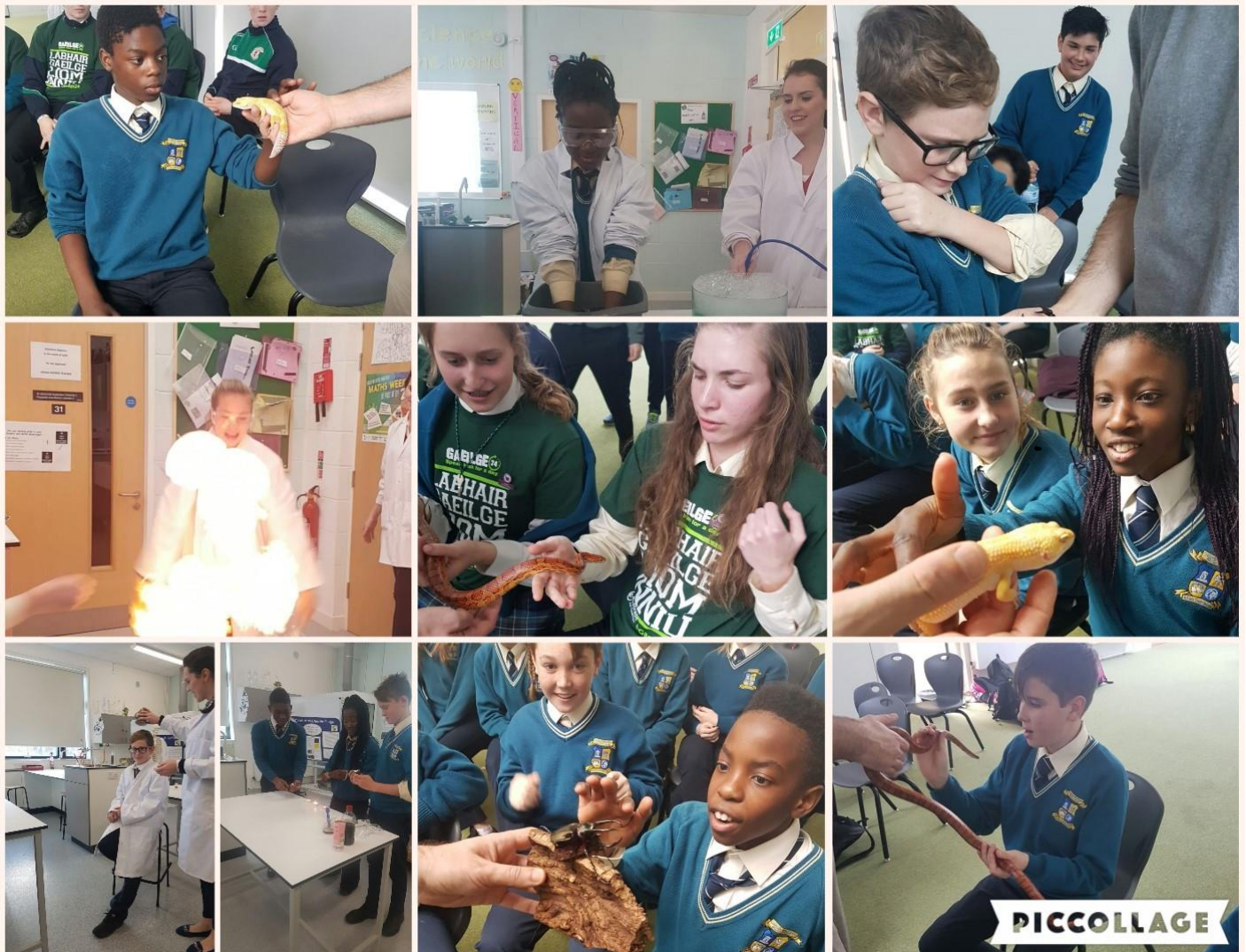
Above: A selection of photographs taken during Merlin College's Science Week in November, 2016.